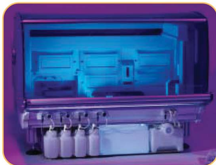
The dark cover protects your reagents and reactions from environmental contaminants, securely locking during the entire assay run.