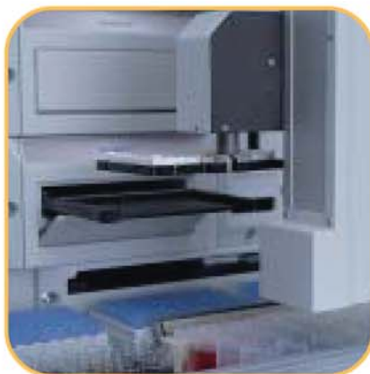
The DSX robotic arm moves microplates and pipettes all sample and reagents.