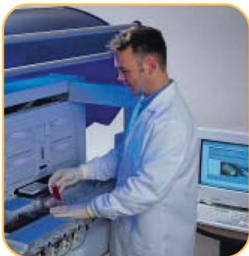
The DSX simplifies workload setup by walking you through where to load consumables and samples