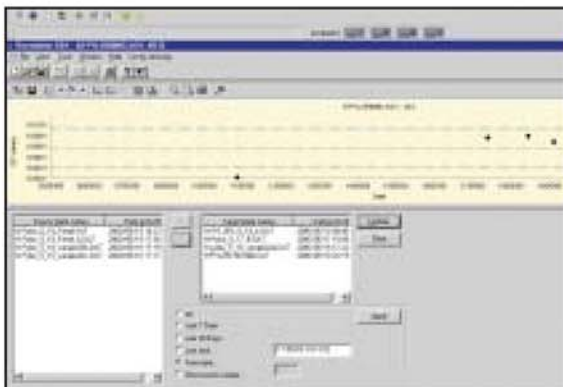
Revelation software incorporates Levey-Jennings statistical analysis.

Pipette Security. Fluid level sensing, tip detection, tip-ejection and clot detection functions protect your assay as well as the DSX robotic pipette.