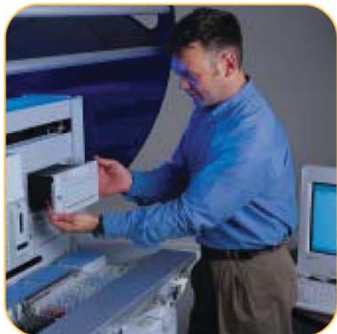
The DSX modular design simplifies upgrades and repairs.